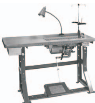
Table mounted machines need a table and motor to run! Why not get yours with a genuine Consew stand?

They come complete in either knock-down or pre-assembled versions.